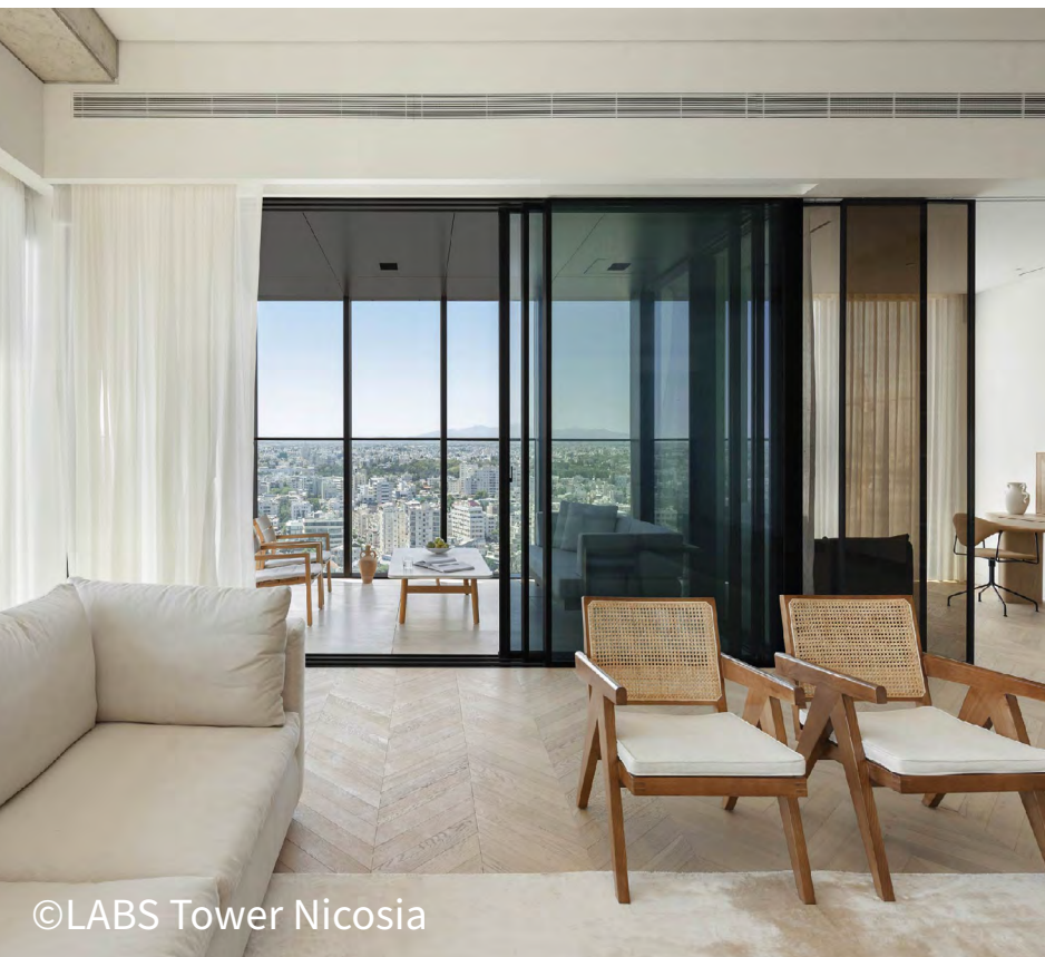
Tower Nicosia

“Hitachi VRF systems were chosen for their relatively small carbon footprint and good performance and very good efficiencies in both heating and cooling”