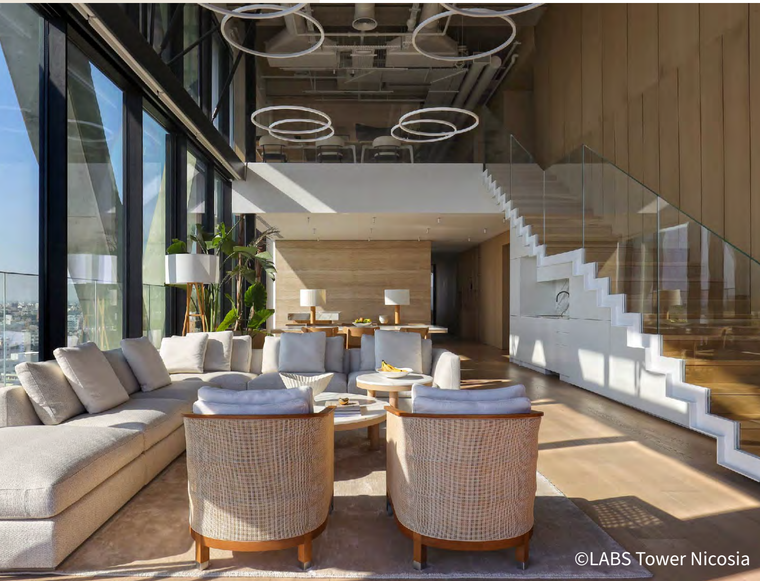
Tower Nicosia