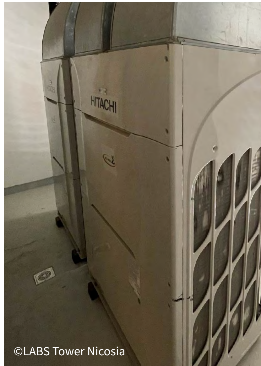
©LABS Tower Nicosia

“Hitachi VRF systems were chosen for their relatively small carbon footprint and good performance and very good efficiencies in both heating and cooling”