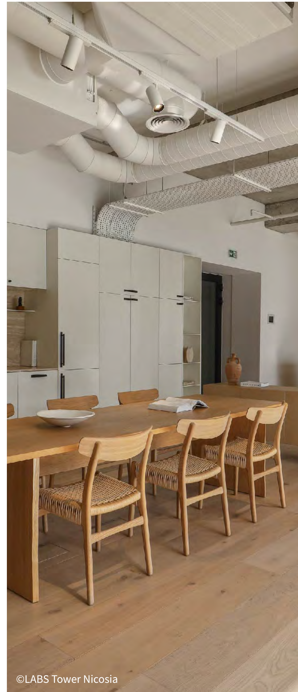
©LABS Tower Nicosia